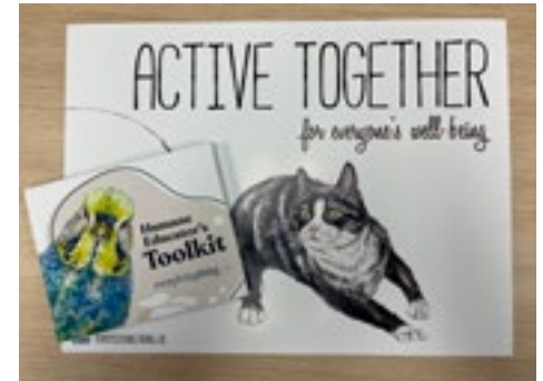
Our Active Together classroom poster will be handed out at Teachers' Conventions

Every February and March, Alberta SPCA educators and volunteers attend teachers' conventions across the province. These two-day professional development events provide a platform to connect with teachers and share information and resources that inspire kindness, respect, responsibility and empathy towards animals, people and the environment - every living thing!