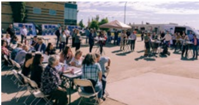
Alberta SPCA 65th Anniversary event - Sept. 10, 2024

Last month we celebrated our milestone 65th anniversary of speaking on behalf of Alberta's animals with a small event at our Edmonton head office. While it's important to acknowledge the past, we're not dwelling on it. We're looking to the future as there's too much work to get done.