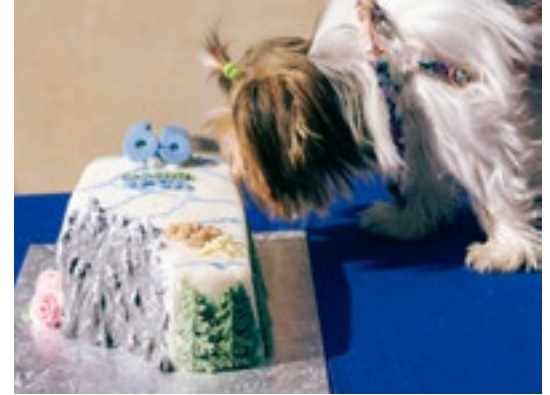
Rescue dog Poppy indulges in a specially made cake for our canine friends.